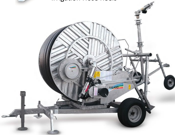
Shown with optional riser on gun cart.