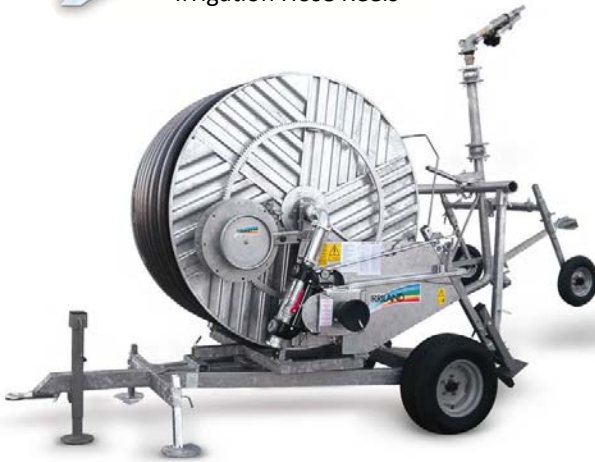
Shown with optional riser on gun cart.