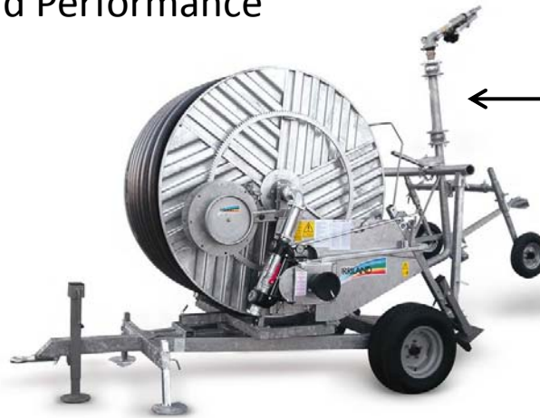
Shown with optional riser on gun cart.

Silver series inlet pressure = 170 PSI max